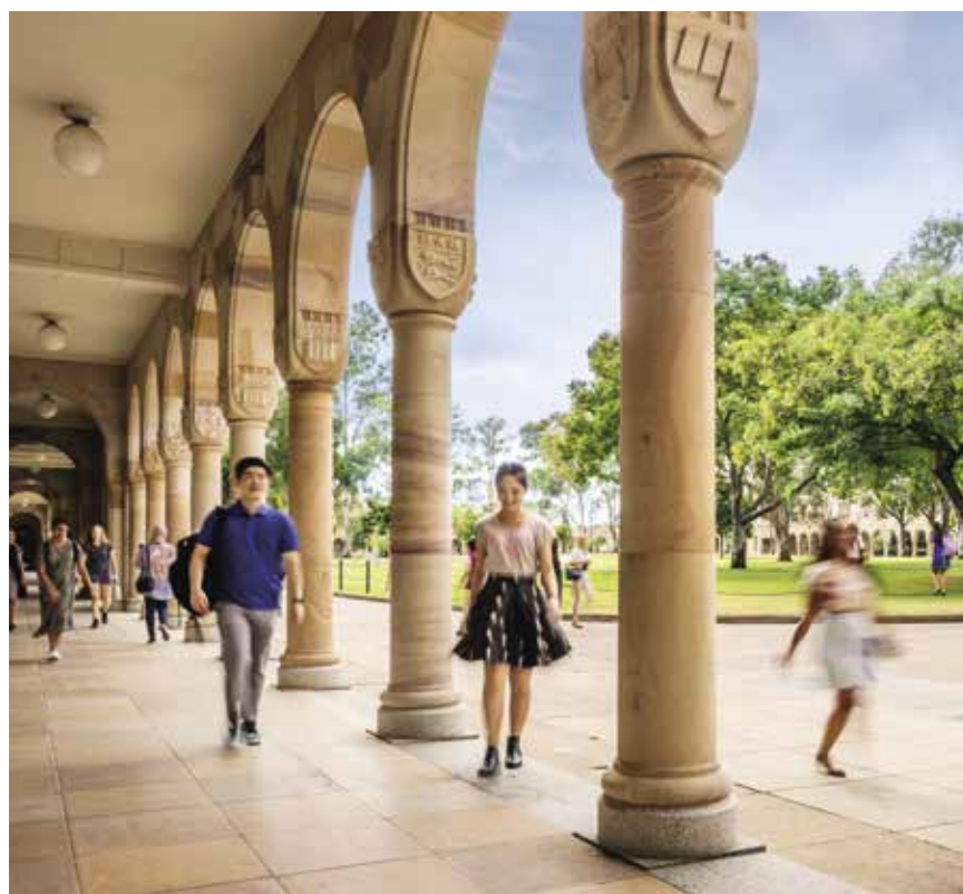
UQ St Lucia