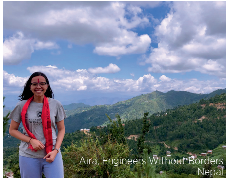
Aira, Engineers Without Borders Nepal

employability.uq.edu.au/short-term-experiences